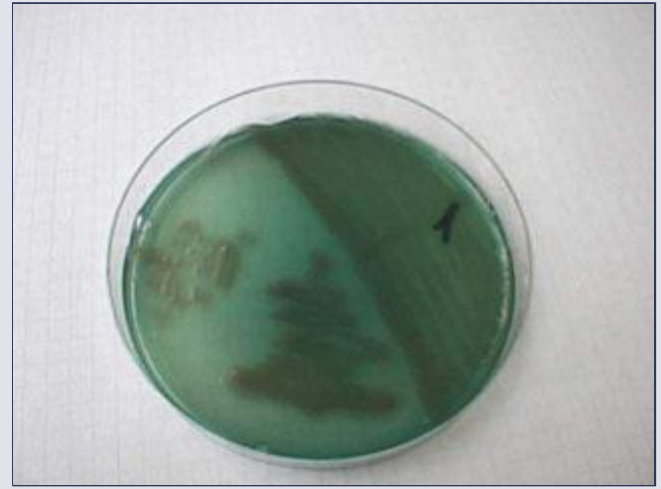
[Example of Pseudomonas aeruginosa]

Microbes Tested: Salmonella typhimurium and Pseudomonas aeruginosa