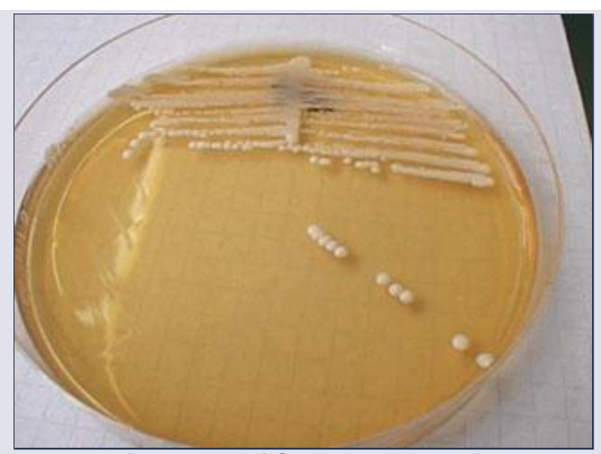
[Example of Candida albicans]

Results: Reduction of population counts from >1 billion to undetectable in two minutes.